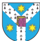
“Alexandru Ioan Cuza” University of Iasi