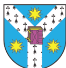
"Alexandru Ioan Cuza" University of Iași