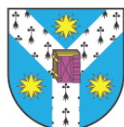
“Alexandru Ioan Cuza” University of Iasi