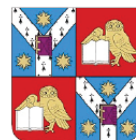
Faculty of Philosophy and Social-Political Sciences Department of Political Science, International Relations and European Studies