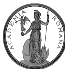
ACADEMIA ROMÂNĂ – FILIALA IAȘI