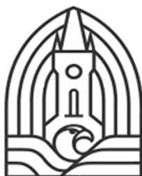
COMPLEXUL MUZEAL MOLDOVA IAȘI