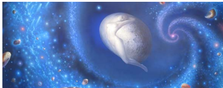
The Galaxy of Love, Mihai Eminescu Aula Magna